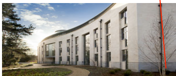
The Stephen Hawking Building